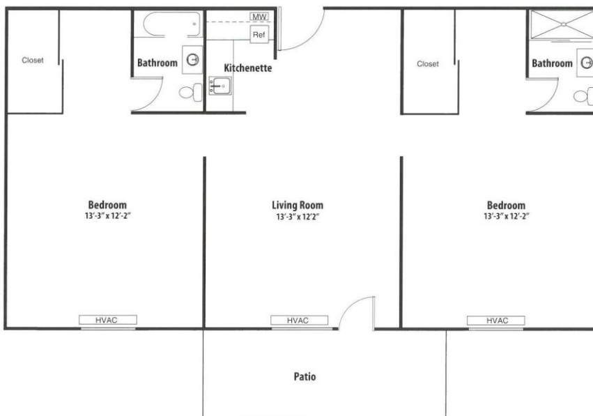
2 Bedroom Apartment 765 sq. ft